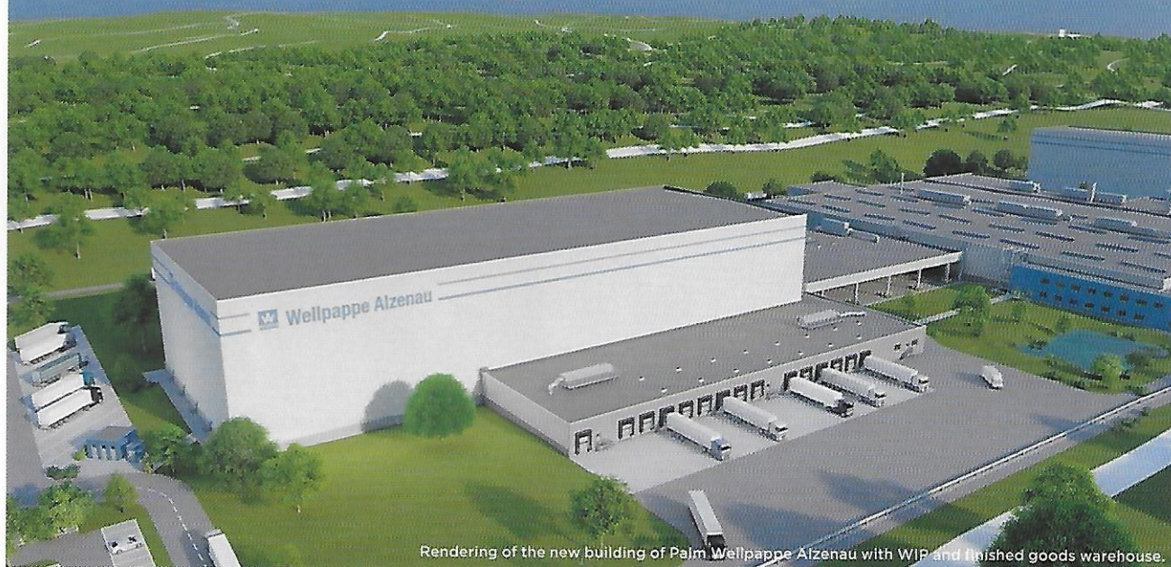
Rendering of the new building of Palm Wellpappe Alzenau with WIP and finished goods warehouse.

here), demonstrates the solution's scalability: featuring 2.0 million square metres of format sheet storage capacity and 41,800 net storage positions for finished goods.