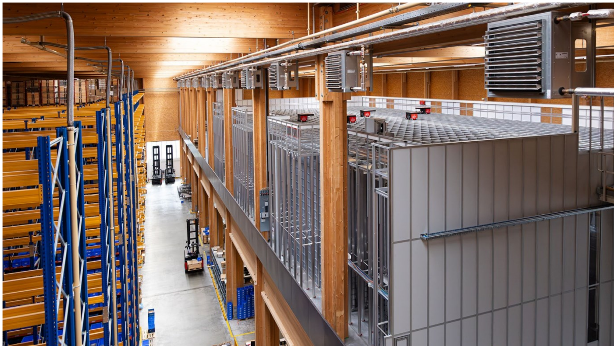
Figure 1 cargo-partner takes the path of partial automation, with manual narrow-aisle warehouse and AutoStore small parts warehouse in one system

Munich/Vienna, July 2025 – Following their order in 2024, HÖRMANN Intralogistics was able to finalize an AutoStore® facility for cargo-partner GmbH as planned. The new storage area was built on the existing mezzanine in the iLogistics Center Vienna, which was opened in 2018 using ecological timber construction. With this project, cargo-partner is expanding its capacities in spare parts logistics and strengthening its position as a 3PL provider in a dynamic market environment.