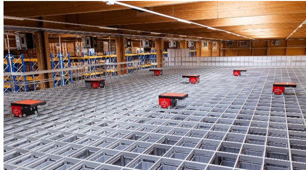
Figure 3 The nimble AutoStore robots in action

The implementation and commissioning were carried out in close coordination with ongoing operations. The plant has been in regular operation since June and shows stable throughputs of up to 180 storage and over 500 retrieval per shift.